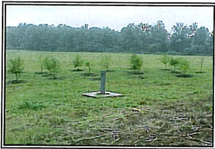
Start of remediation in 1999

After sufficient data is collected to evaluate the remedial options, Cardinal works with their client to decide upon the optimal solution. These decisions will be highly dependent on the client's plans for the property in the future. Because of Cardinal Resources' extensive experience in dealing with federal, state and local regulatory agencies, our personnel will assist you with any discussions with regulatory agencies before, during, and after the remedial option has been selected.