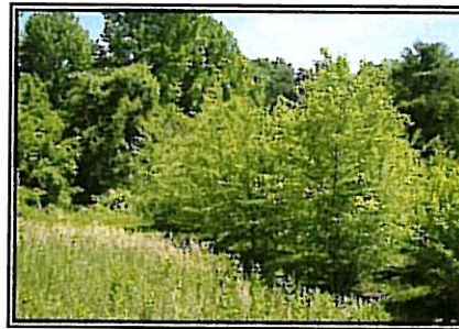
Follow-up visit in 2006